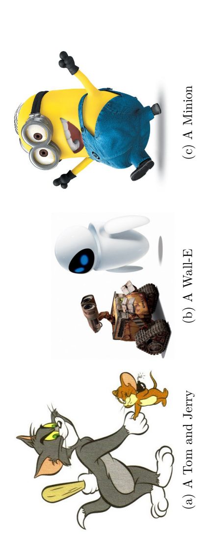
Fig. 2.2 Best Animations