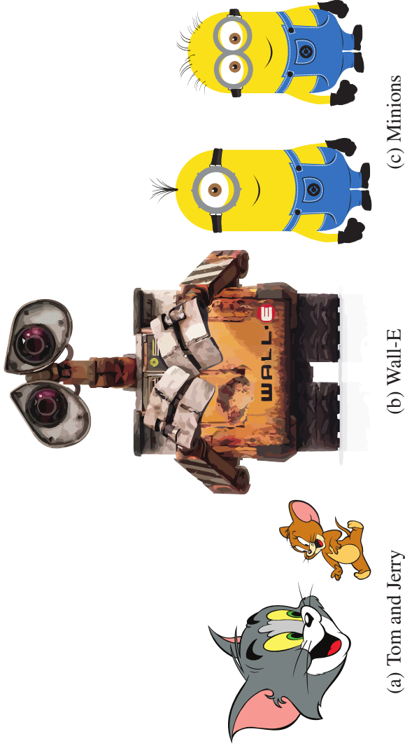
(a) Tom and Jerry