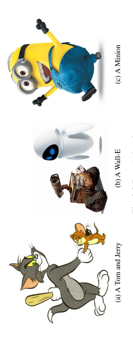
Fig. 2.2 Best Animations