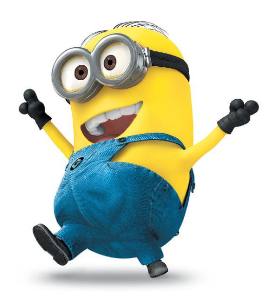
Fig. 2.1 This is just a long figure caption for the minion in Despicable Me from Pixar

The SI Units for dynamic viscosity is N s m^{-2} . I'm going to randomly include a picture fig. 2.1. If you have trouble viewing this document contact Krishna kks32@cam.ac.uk.