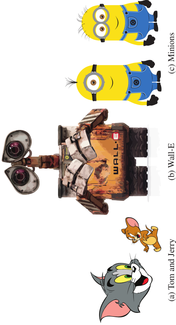
Fig. 2.2 Best Animations