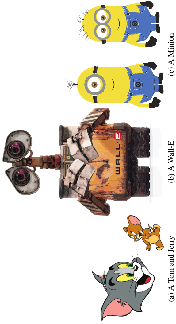
Fig. 2.2 Best Animations