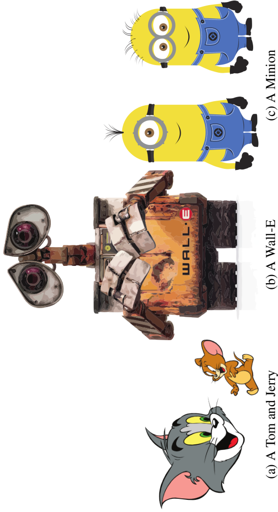
(a) A Tom and Jerry