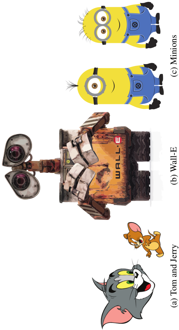
Fig. 2.2 Best Animations