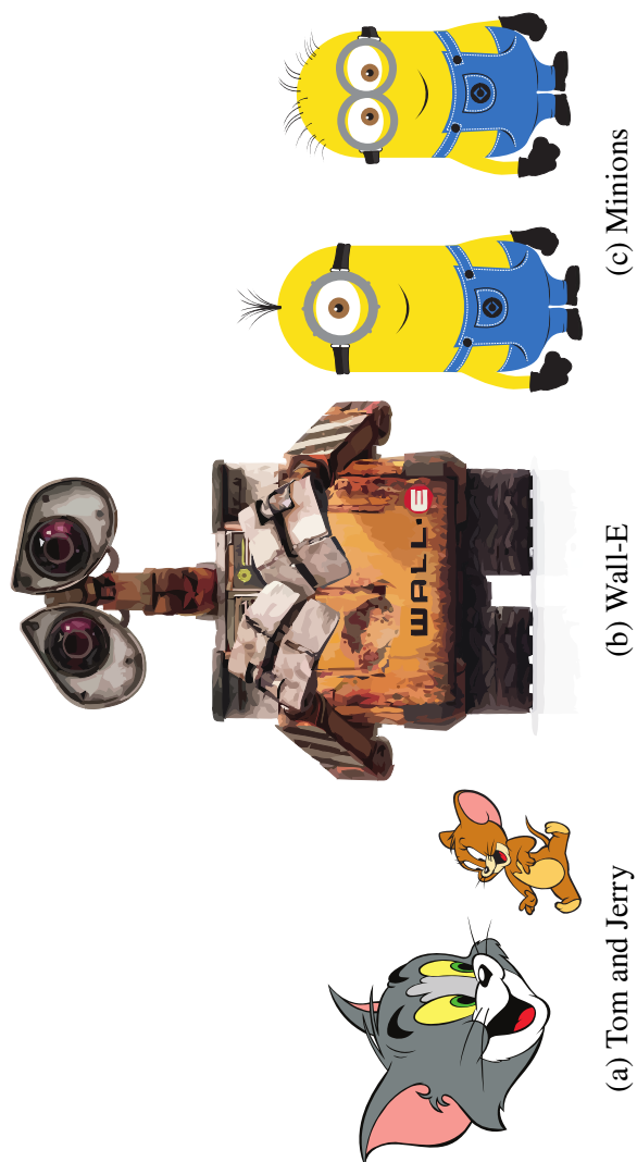
Fig. 2.2 Best Animations