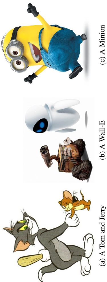
Fig. 2.2 Best Animations