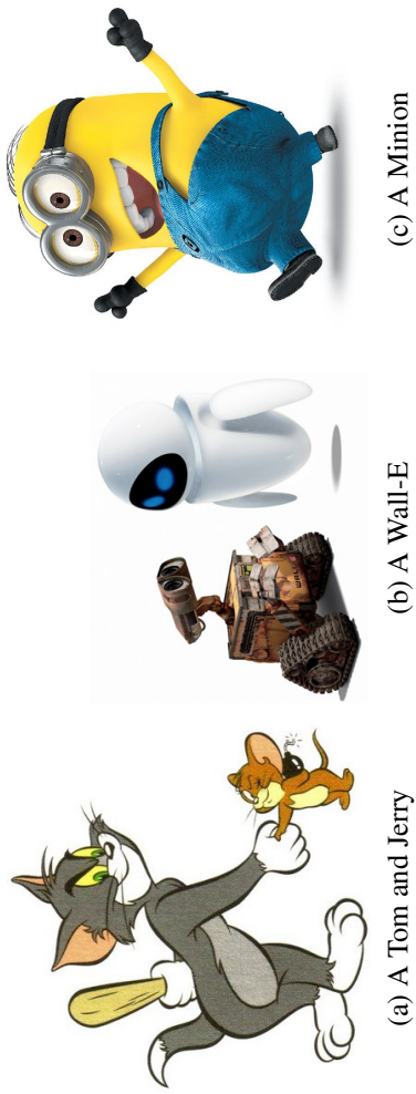
Fig. 2.2 Best Animations