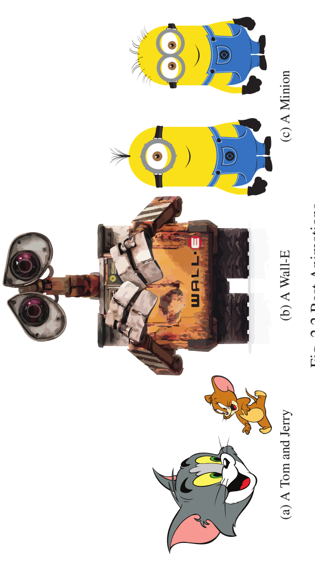
Fig. 2.2 Best Animations