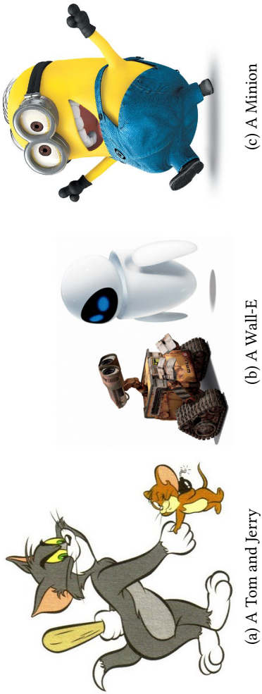
Fig. 2.2 Best Animations