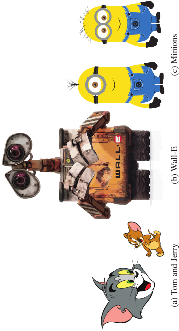
Fig. 2.2 Best Animations