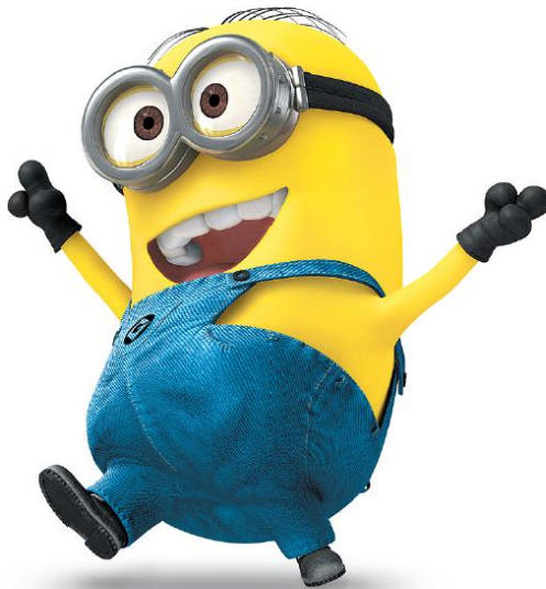
Fig. 2.1 This is just a long figure caption for the minion in Despicable Me from Pixar

I'm going to randomly include a picture fig. 2.1