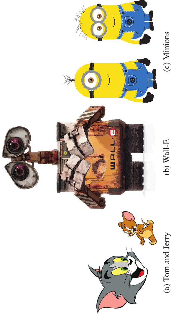
(a) Tom and Jerry