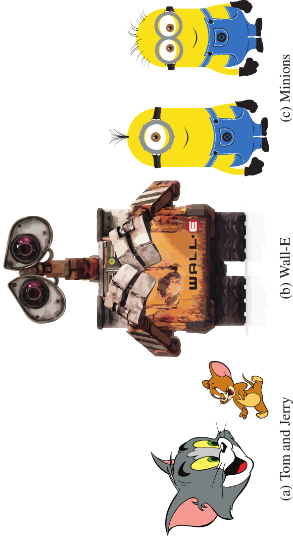
(a) Tom and Jerry