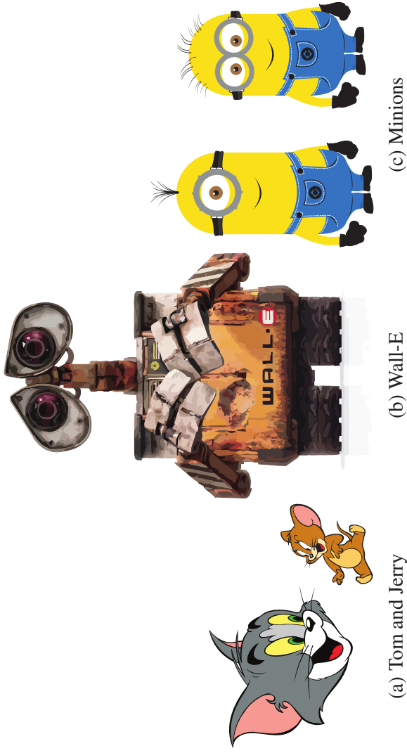
(a) Tom and Jerry