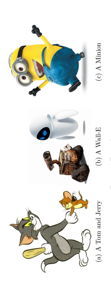
Fig. 2.2 Best Animations

I can cite Wall-E (see fig. 2.2b) and Minions in despicable me (fig. 2.2c) or I can cite the whole figure as fig. 2.2